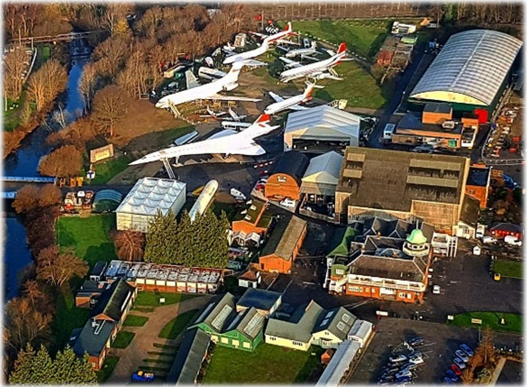
CONCORDE is included in the large collection of aircraft, motor cars and bikes in the Brooklands museum