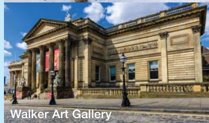
Walker Art Gallery