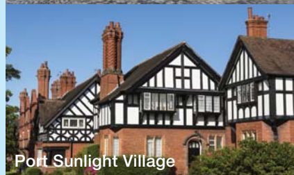
Port Sunlight Village

4 days from £469 Departing 16th June 2020