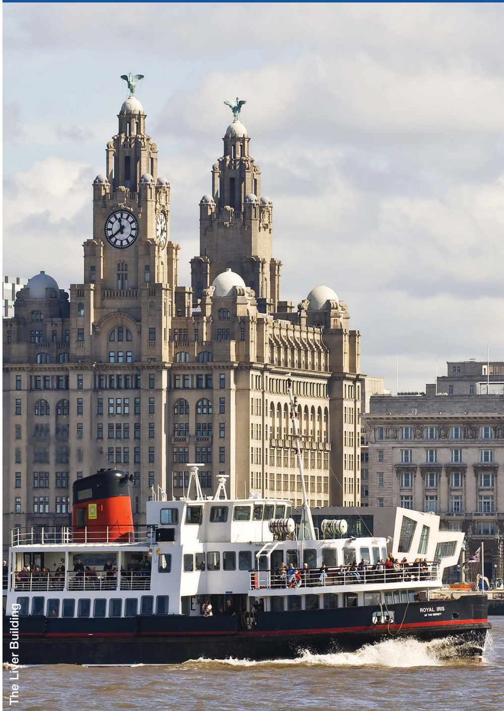
The Liver Building

Price based on twin share. Minimum numbers required. Normal booking conditions apply.