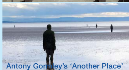
Antony Gormley's 'Another Place'