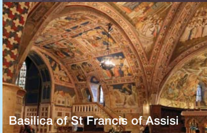
Basilica of St Francis of Assisi