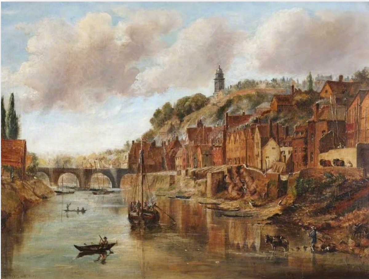
(Below) Painting of Bridgnorth by C A Hopworth in 1870

We will stop at this lovely town and ride the cliff railway to the high town for lunch at one of the many pubs and restaurants with a chance to wander around and visit Thomas Telford's church before moving on to Wenlock Priory.