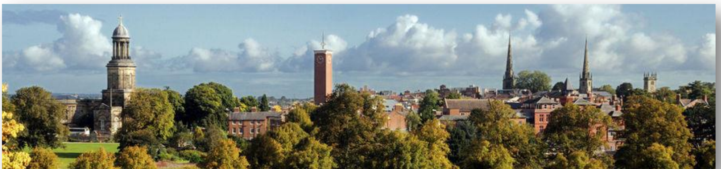
The spires and towers of Shrewsbury

The map of Shropshire shows most all the places we intend visiting except our visit to Bourton in the Cotswolds on the way home